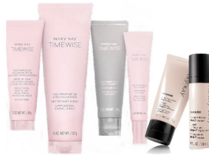
ultimate miracle 3D $165 (save $18)