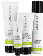
clearproof set $45 (save $4)