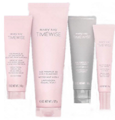
miracle set 3D $110 (save $14)