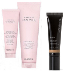
timewise 3D basic $70 (save $8)