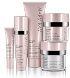
timewise repair set $205 (save $39)