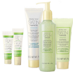
satin set $49 (save $5)