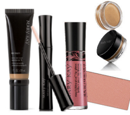
dash out the door $70 (save $6)