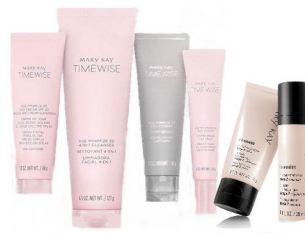
ultimate miracle 3D $165 (save $18)