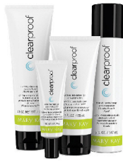
clearproof set $45 (save $4)