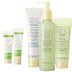
satin set $49 (save $5)