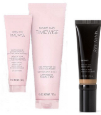
timewise 3D basic $70 (save $8)