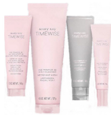
miracle set 3D $110 (save $14)